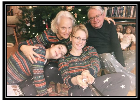
The Campbell Family

Determining the size and number of residents per units must be informed by potential residents, but should also include consideration of LTSS arrangements. If access to HCBS in consumer-controlled homes is only limited to persons with low support needs, this will influence the population of a strictly consumer-controlled community to those with low support needs or others who can private pay for residential supports. Therefore, creating space for provider-controlled home's needs to be considered, and discussion with potential providers before home plans are drawn would be valuable.