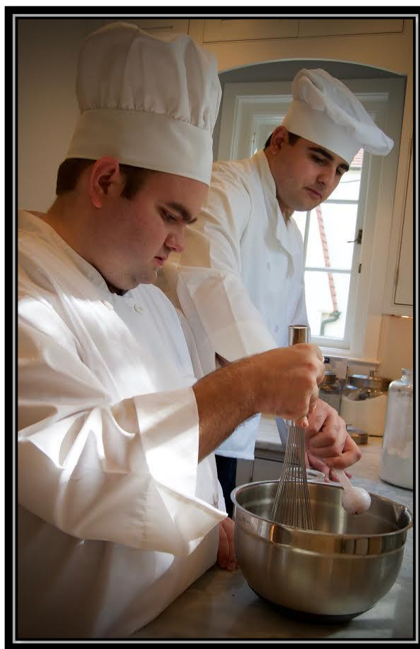
HFL’s intentional community and commercial kitchen will provide a permanent home for Proof Bakers.

The IC will not be a service provider. In order to thrive and participate in the community, residents will choose their own service provider. Because the IC will be consumer-controlled, residents will be able to change providers at any time without having to relocate. Cost may initially preclude some people from becoming residents unless HCBS waiver funds are available.